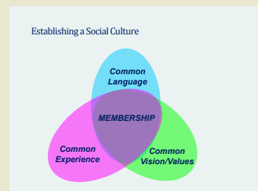
School-wide Social Culture