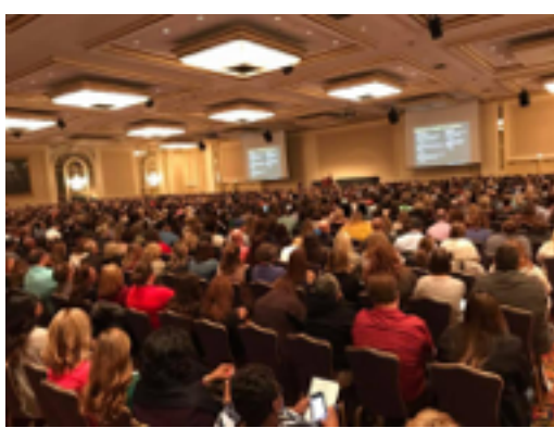
2017 National Forum opening keynote with 2600 participants!